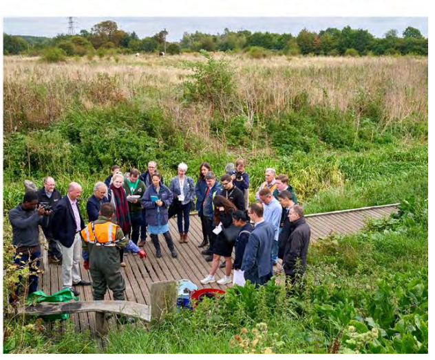
Presented by The Colne Catchment Action Network